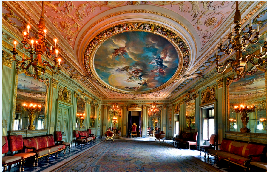
The splendid interiors of Lalbagh Palace

Thing to do : Indore is known for its street food. The Sarafa bazaar is specially famous street food lane. When in Indore breakfast of poha-jalebi must be tried.