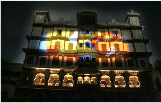
Sound & Light Show at Rajwada

About 10 kms from the city at the Jain site of Gomatgiri, is a massive 7 m statue of Lord Gomateshwar . There are also 24 marble temples, each dedicated to a Tirthankara.