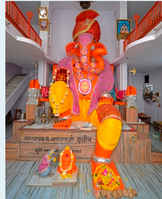
Bada Ganapati Mandir