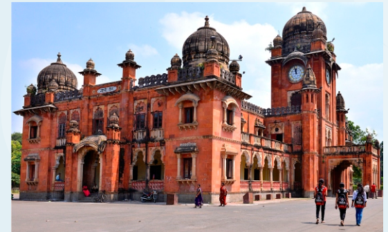
Gandhi Hall, locally also known as Ghanta Ghar

On a hillock near the airport is the temple of Bijasen Mata , built in 1920, and a heritage building that now houses the Border Security Arms Museum. A popular picnic spot, the place offers a breathtaking view of Indore city by night.